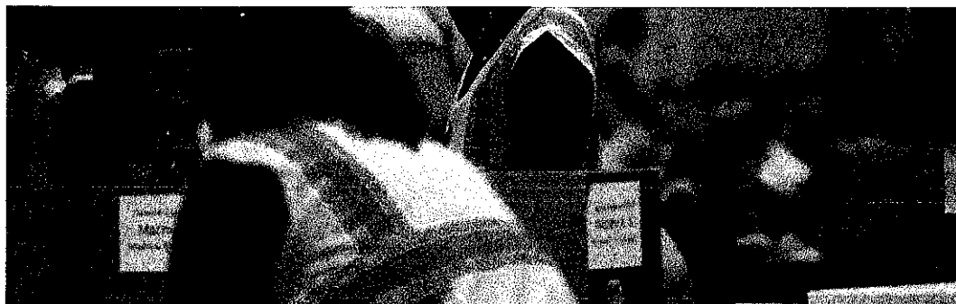
Election workers count ballots in Philadelphia, Penn., on Nov. 4, 2020.